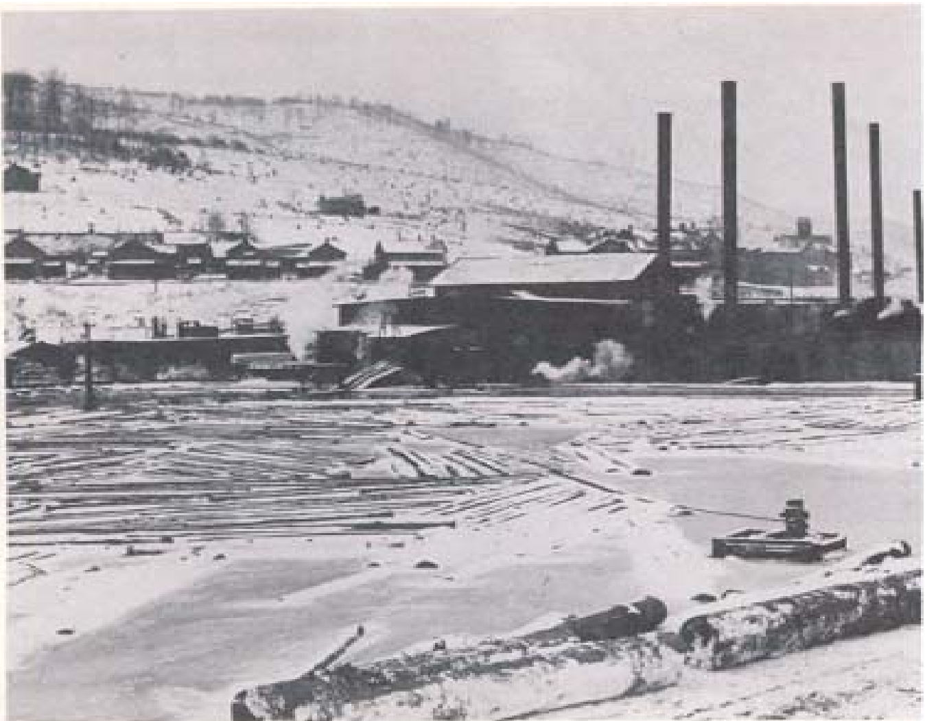
The Goodyear sawmill in Austin, Pennsylvania